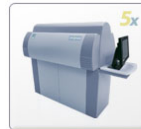
The Chromira5x is the world's fastest LED printer Learn More Now>>

Whether you're a small full service lab or a large portrait/social imager, the Chromira 5x 30 can meet all of your digital print production needs with high production and state-of-the-art image quality. ZBE's WorkStream Imaging Automation and Order Management software offers a comprehensive array of the packaging and compositing products you need to offer your customers a variety of image options.